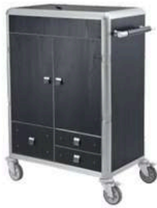
HM7311 Mini Housekeeping Cart