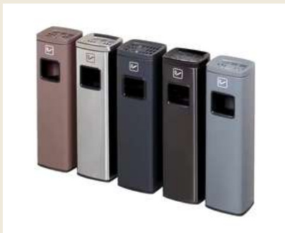
INKS-AT-SQSO size:23(L)X18.5(W)X82.5CM(H) cm COLOR: SS,RG,BG