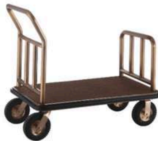
HM7506A Platform Cart