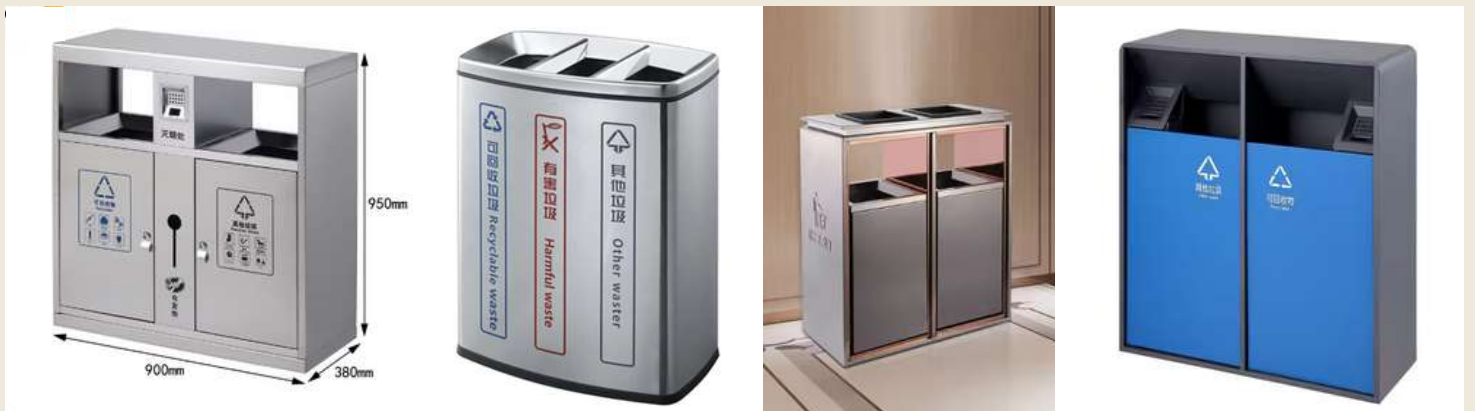
INKS-RB-TH13 size:90(L)x38(W)x95(H) cm