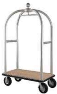
HM7509 Luggage Cart

Discover our range of locally/ China-made hotel operation equipment, meticulously crafted to meet current trends and demands. From hotels operation to kitchenware, our products are well-made, distinctive, and tailored to elevate your hotel's operations.