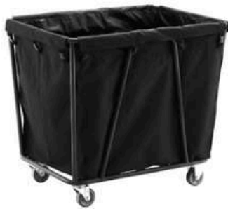
HM7340F Linen Trolley V