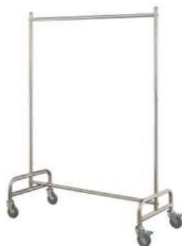
HM7217A Hanger Trolley, Detachable Type