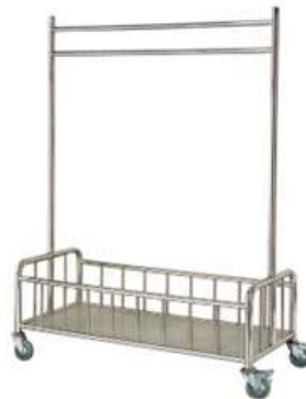
HM7224 Hanger Trolley