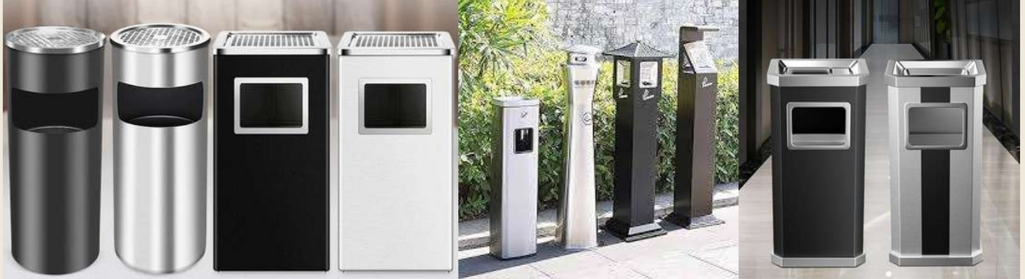
INKS-AT-T002 size:30DIAX65(H) cm COLOR: SS, BM