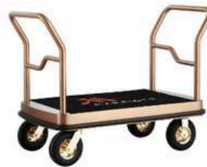
HM7519B Luggage Cart