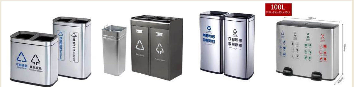
INKS-RB-2HFL30S size:37(L)x25(W)x49(H) cm INKS-RB-2HFL50S size:46(L)x27.6(W)x73(H) cm