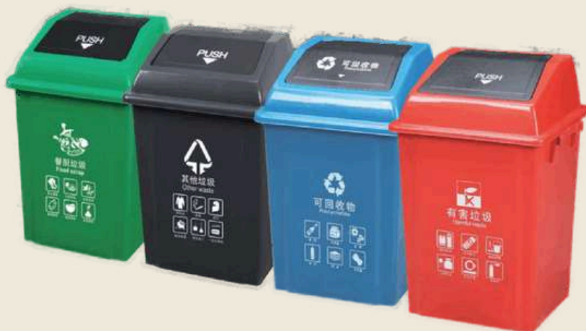
BULLET COVER TRASH CAN

Product innovation, when the shape and parameters are changes, the real sample shall prevail, without notice only available for PREORDER