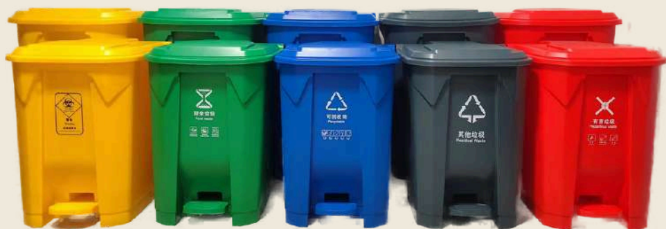
COLOR CODE STEP ON BIN