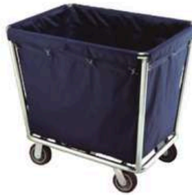
HM7340 Linen trolley