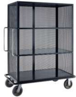
HM7224H Laundry Trolley