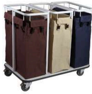
HM7312 3B Sorting Trolley