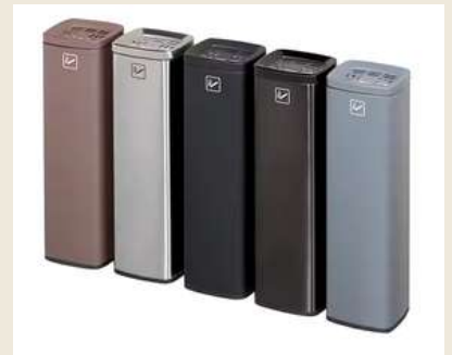
INKS-AT-SQOT size:23(L)X18.5(W)X82.5CM(H) cm COLOR: SS,RG,BG,SV

Product innovation, when the shape and parameters are changes, the real sample shall prevail, without notice only available for PREORDER