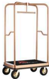
HM7511B Luggage Cart