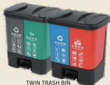
TWIN TRASH BIN