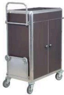
HM7311B ExecMini Housekeeping Cart