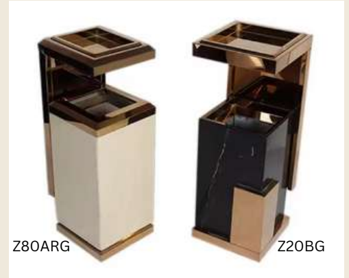
INKS-AT-Z20BG size:30(L)x30(W)x73(H) cm INKS-AT-Z80ARG size:30(L)x30(W)x73(H) cm