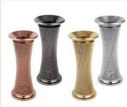
INKS-AT-B802 size:32DIAX68(H) cm