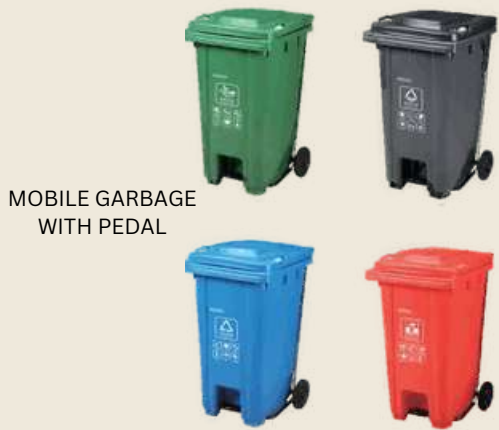
MOBILE GARBAGE WITH PEDAL