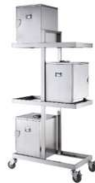
HM7678F Warmer Can Can Keep up to 6 warmer

Product innovation, when the shape and parameters are changes, the real sample shall prevail, without notice only available for PREORDER