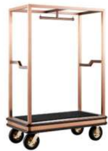
HM7518A Luggage Cart