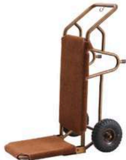
HM7502G-05 Bellman's Handtruck