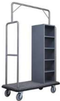
HM7224B Velvet Trolley