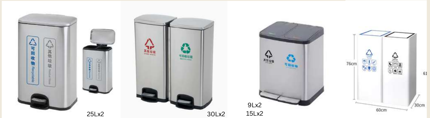
INKS-RB-50LST size:46(L)x36(W)x71(H) cm

A DECORATIVE RECYCLE BIN COMBINES FUNCTIONALITY WITH STYLE, FEATURING INTRICATE DESIGNS AND VIBRANT COLORS TO SEAMLESSLY BLEND INTO ANY SPACE WHILE PROMOTING ECO-FRIENDLY WASTE MANAGEMENT PRACTICES.