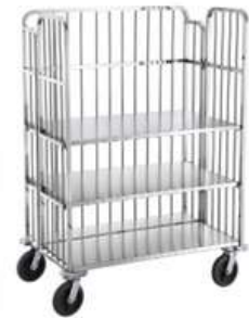
HM7226A Foldable Laundry Cart