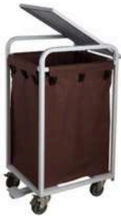
HM7306 Mini laundry Cart w Lid