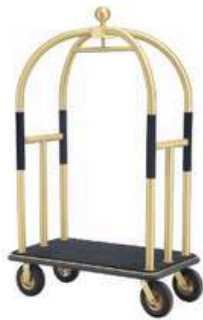
HM7503B Luggage Cart