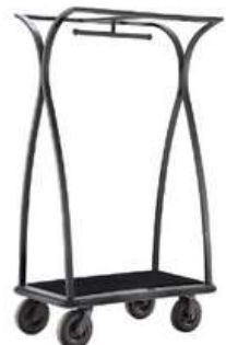
HM7504A Luggage Cart

Product innovation, when the shape and parameters are changes, the real sample shall prevail, without notice only available for PREORDER